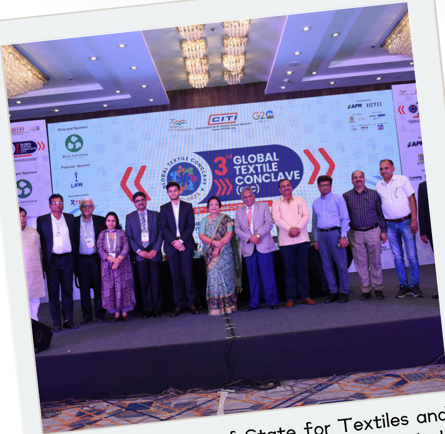
The then Minister of State for Textiles and Railways, Smt Darshana Vikram Jardosh with the Jury of CITI Award 2022-23