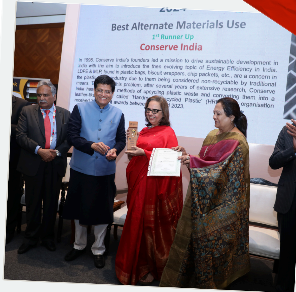
The then Hon'ble Union Minister of Textiles, Shri Piyush Goyal and the then Hon'ble Minister of State for Textiles and Railways, Smt Darshana Jardosh with 1st Runner UP.