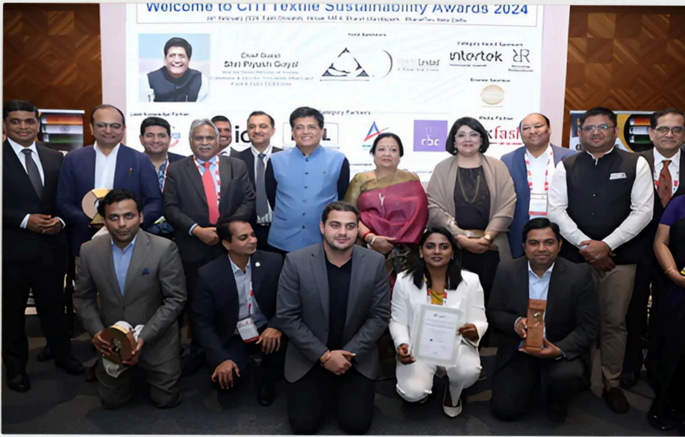
The then Hon'ble Union Minister of Textiles, Shri Piyush Goyal and the then Hon'ble Minister of State for Textiles and Railways, Smt Darshana Jardosh with the winners of the CITI Textile Sustainability Awards 2023-24.