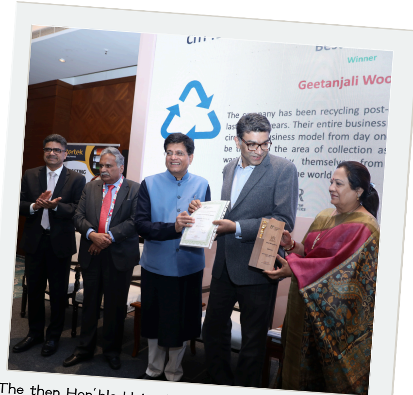
The then Hon'ble Union Minister of Textiles, Shri Piyush Goyal and the then Hon'ble Minister of State for Textiles and Railways, Smt Darshana Jardosh with Mr. Deepak Goel Director, Geetanjali Woollens